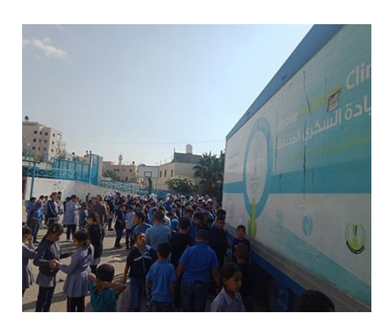
Diabetes awareness campaigns focusing on lifestyle modification conducted in schools and refugee camps.