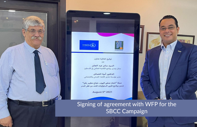
Signing of agreement with WFP for the SBCC Campaign