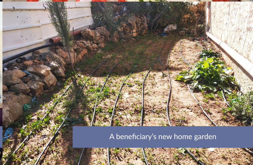
A beneficiary's new home garden