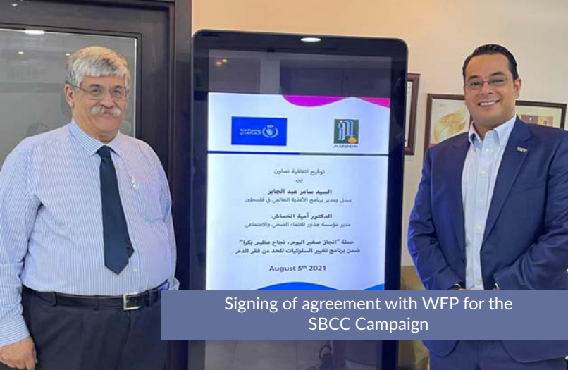
Signing of agreement with WFP for the SBCC Campaign