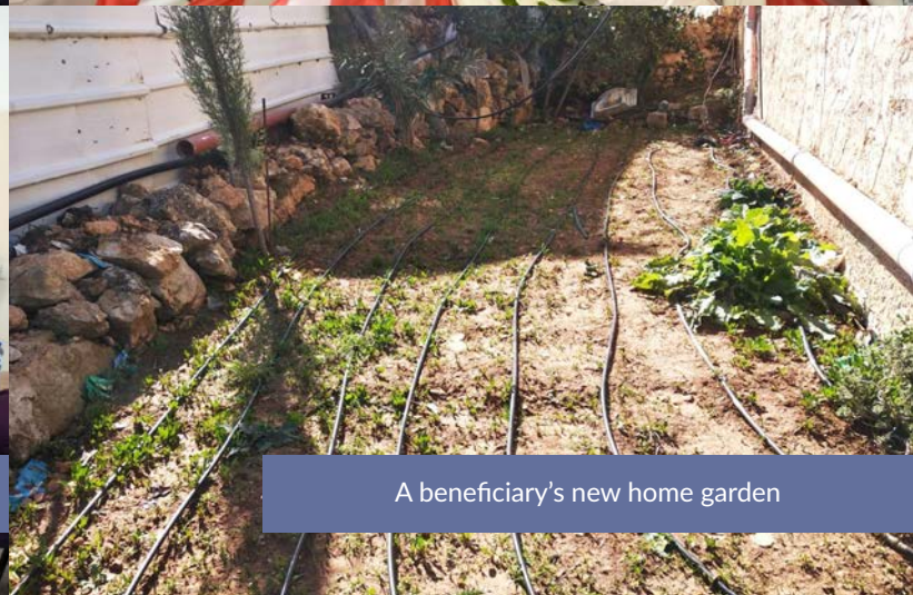
A beneficiary's new home garden